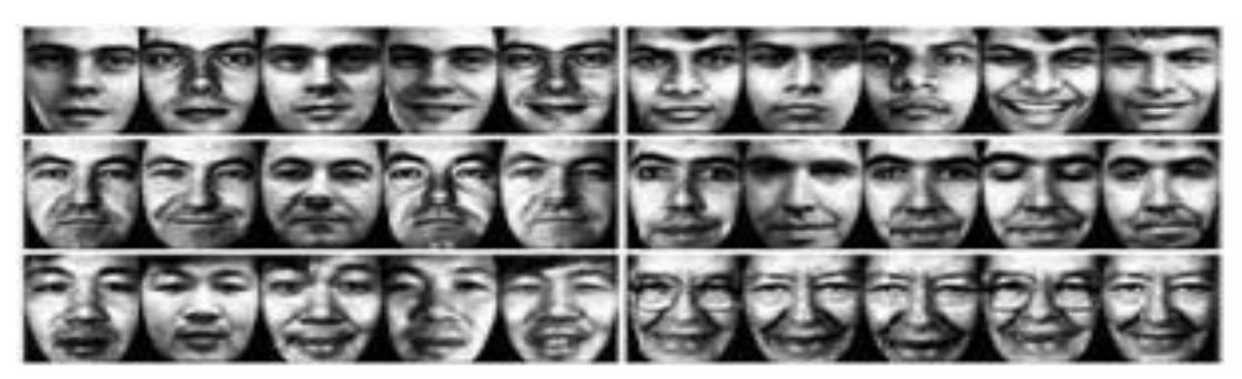
Fig 2. Examples of Six Classes using LDA

EBGM: Elastic Bunch Graph Matching Elastic Bunch Graph Matching relies on the assumption that real facial images have many non-linear features that are not considered through the specific analytical methods mentioned earlier, such as lighting variations (external light versus internal fluorescents), posture (vertical versus lectures) and self-expression ( a smile explodes on