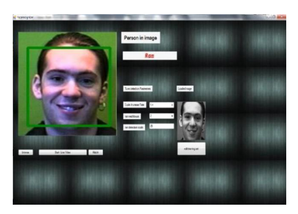
Fig7. Face Identification with Image

This allows us to calculate the sum of all pixels within any given rectangle using only four values. These numbers are the pixels in the merging image that correspond to the rectangular corners in the input image. The Viola-Jones Face Detector analyzes the provided floor window using features with two or more sides. Each element results in a single number calculated by subtracting the sum of the white (white) rectangles from the value of the black rectangle. Viola -Jones found that with a clinic with a basic solution of 24 * 24 pixels it provides satisfactory results. With the consent of all possible sizes and positions of approximately 160,000 different features can be created. Thus the number of possible features significantly exceeds the 576 pixels contained in the detector in basic resolution. Following pictures Screenshots from our corresponding.